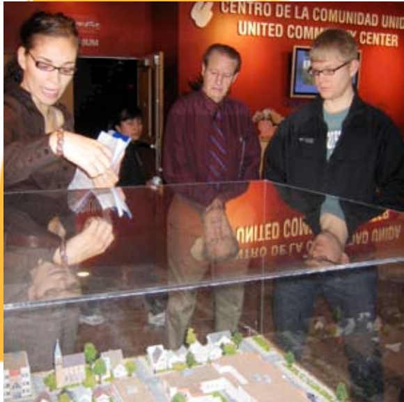
United Community Center, Milwaukee, WI