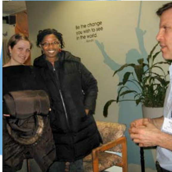
Walker's Point Community Clinic, Milwaukee, WI