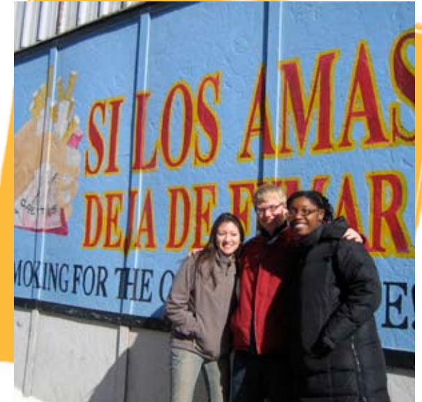
TRIUMPH students promoting smoking cessation.