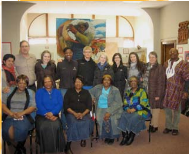
Black Historical Museum & Society, Milwaukee, WI